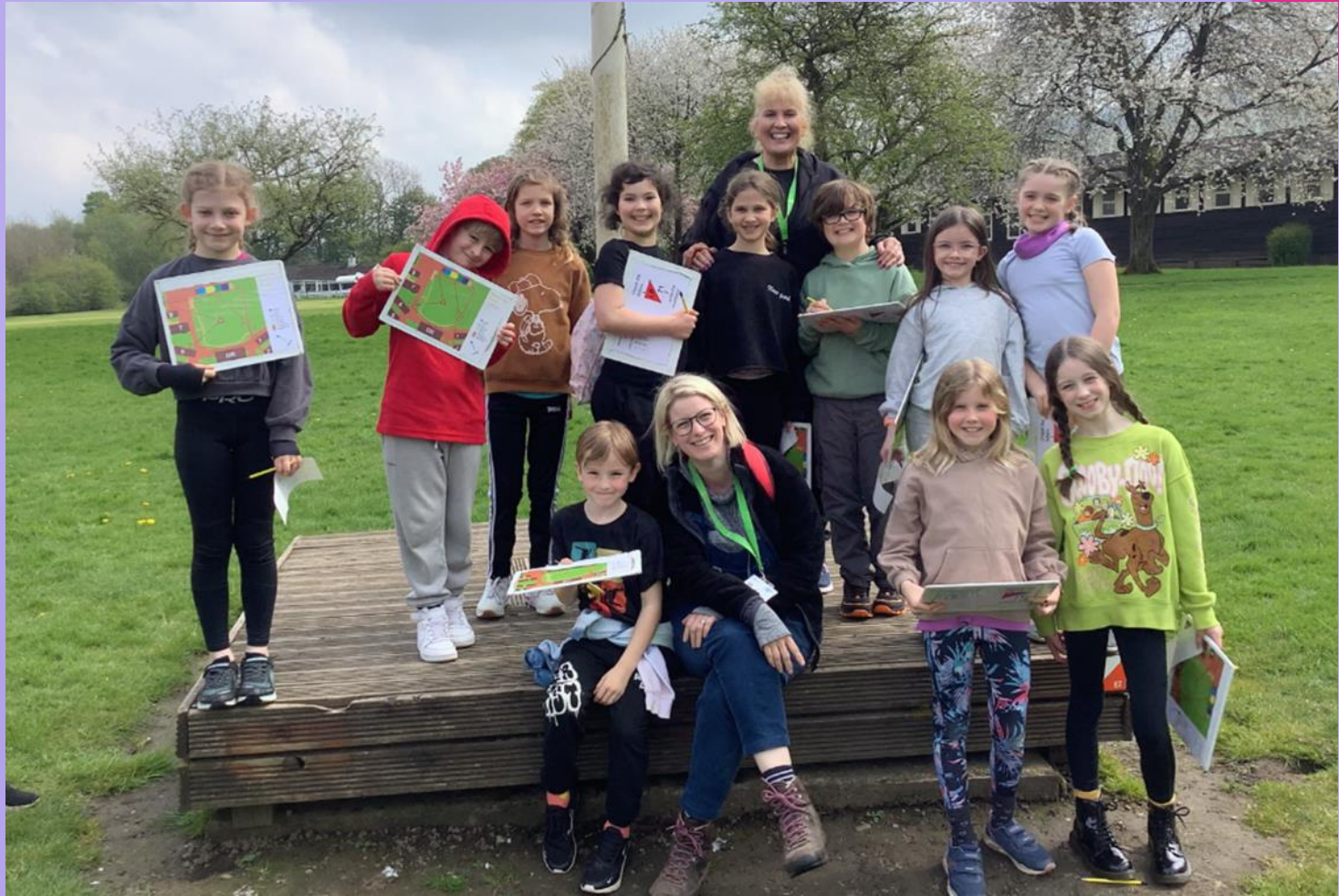
Orienteering course at Bewerley