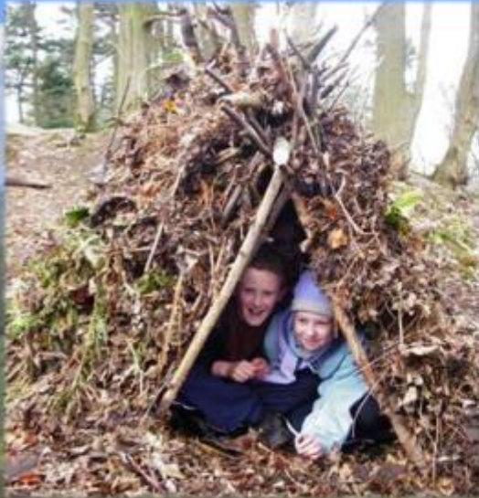
Shelter building and bushcraft