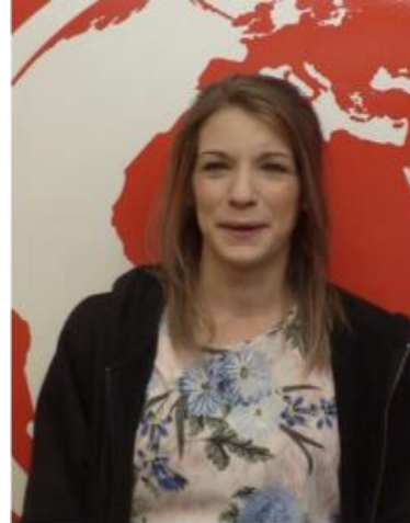
Miss Winter GTA