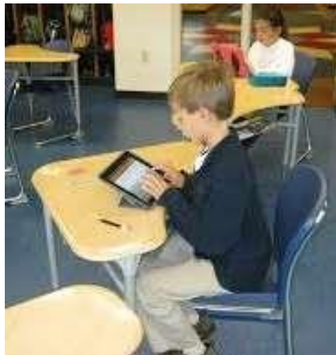
Using case to angle screen when typing

Please note that a copy of this acceptable use policy can also be found on the school's website.