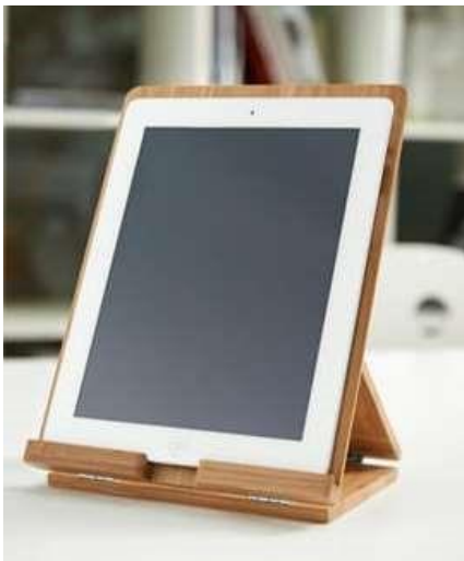
IKEA tablet stand

Limit the time that the child is on the iPad and take regular breaks, lifting the head and getting up and moving around.