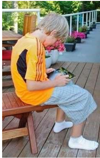
Poor neck posture

The iPad is small and portable so changing position regularly can be beneficial.