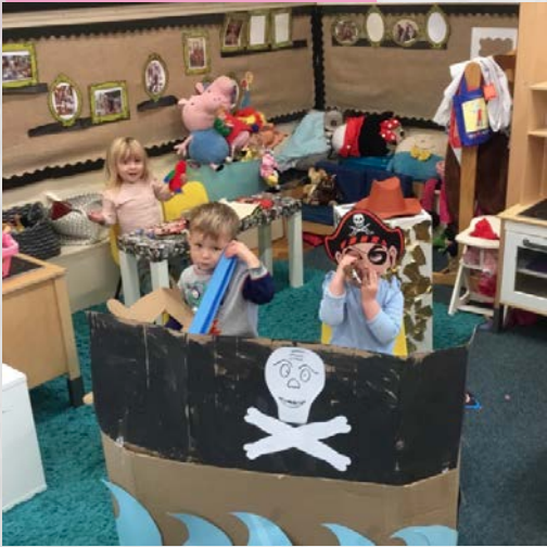
Pirates landing in Turquoise Room!