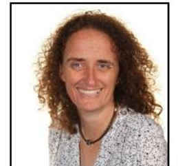
Miss Thompson Nursery & The Hive