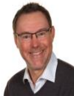
Stuart Hall Co-opted Governor